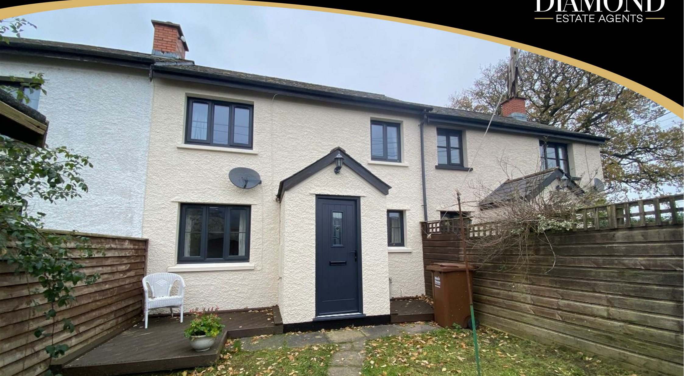
Wisteria Cottage Pennymoor Tiverton, EX16 8LF £800 PCM